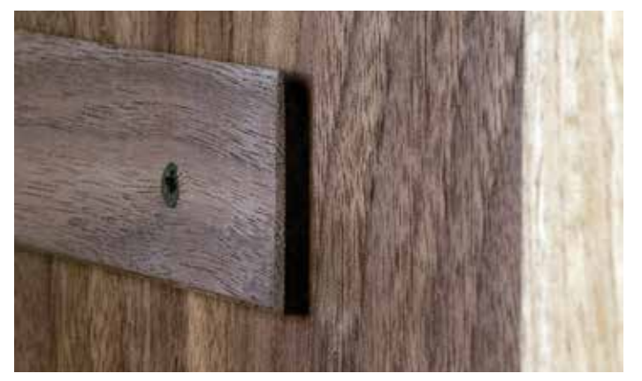
A dovetail shaped cleat holds the rack in place