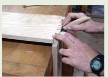
Marking the pins