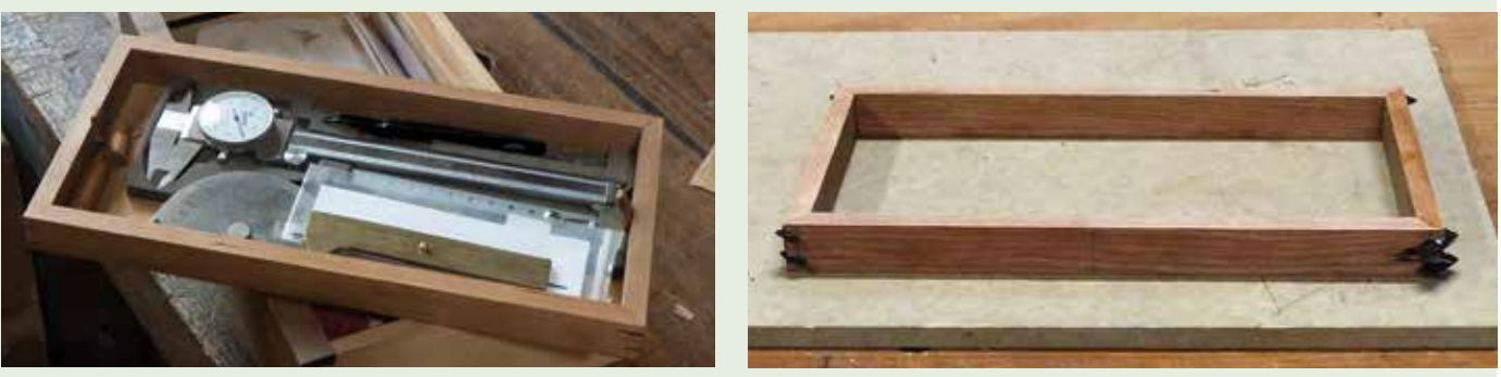
Marking and layout tools share the same drawer

One way of getting your tools in better order in the drawers is to make small trays that lie on ebony strips inside the drawer. I made this one with some scrap cherry. The fastest way was by making mitres, gluing them and then adding some splines to add strength to the set. Making the bottom couldn't be more easy; as I was looking at an old tools catalogue, I noticed that small boxes for measuring tools used to have thin guartersawn wood bottoms just glued at the box bottom, so I tried this with quartersawn red cedar. It couldn't have worked better.