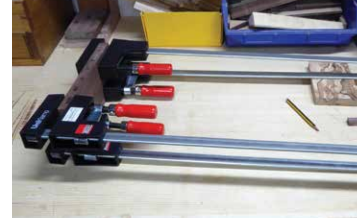
Gluing the two parts of the rack together

There needed to be enough space between the cabinet and the workbench underneath it. However, this meant that most parts of the cabinet would be too high to reach comfortably. So I placed the most-used tools in the more reachable zone and in the top of the drawers, making small trays for the inside of the drawers. I did the same with the doors. As you can see, the plane handles are just reachable on the upper shelf. I used rare earth magnets to keep the planes in place.