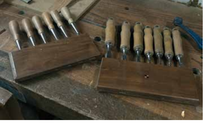
The racks also prevent the chisels from rolling around the bench