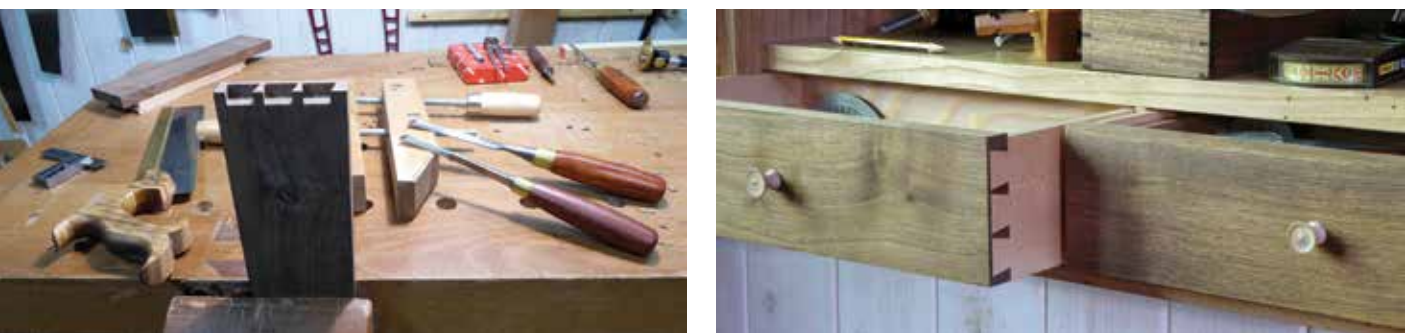
Making the pins on the drawer fronts