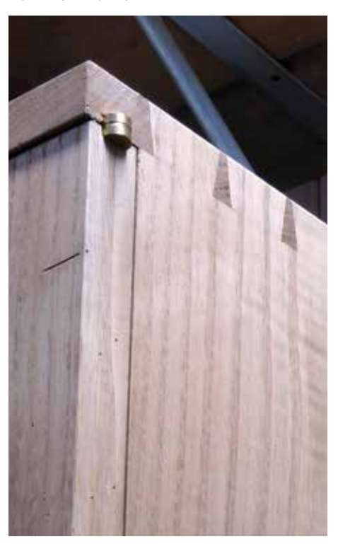
Just the knuckle is exposed at the side of the cabinet

order to fit them perfectly. I marked the hinges in place on the dry fit, placing the doors to test their places, and then made the mortises for them. I then assembled the carcass again and marked on the doors. I tested them before gluing everything together. F&C