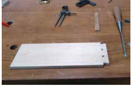
Making the tails on the drawer sides

them just with chisels because they are usually very small and short. I also leave the sides a bit longer just to be able to pull the drawer all the way and see the inside and to allow for seasonal movement. Sliding dovetails help keep everything together and square even without glue. Most of my drawer bottoms are made of soft wood but since I had some thin boards of ash left over from another project, I decided to use them instead. I used holly for the pulls to add more contrast.