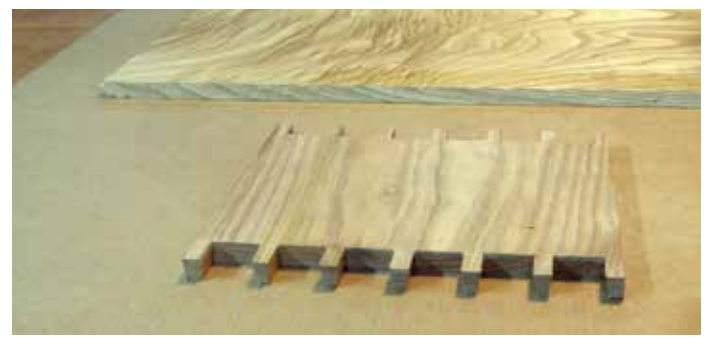
Pins in the carcass bottom