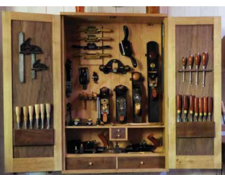
The cabinet keeps the tools accessible and orderly

n order to keep my tools at hand, protected and well