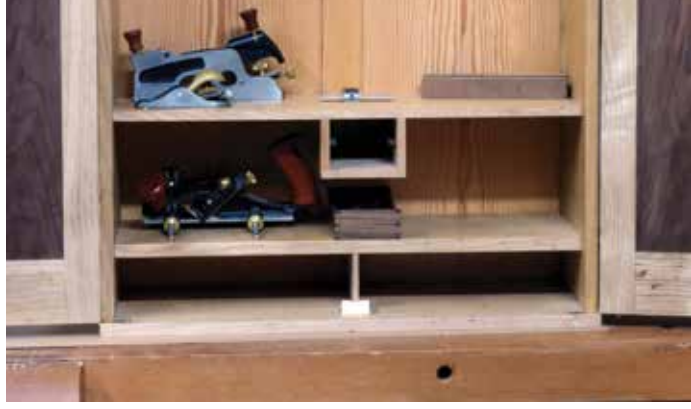
Tools that are used most often are stored on the lower shelves RIGHT: Rare earth magnets keep the planes in place

There needed to be enough space between the cabinet and the workbench underneath it. However, this meant that most parts of the cabinet would be too high to reach comfortably. So I placed the most-used tools in the more reachable zone and in the top of the drawers, making small trays for the inside of the drawers. I did the same with the doors. As you can see, the plane handles are just reachable on the upper shelf. I used rare earth magnets to keep the planes in place.