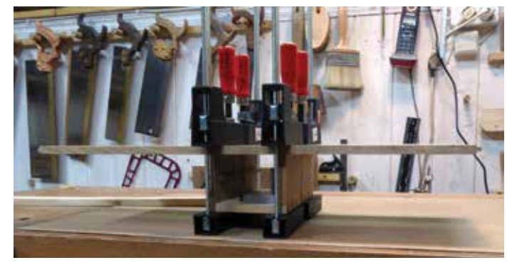
Gluing the hanging drawers in the carcass